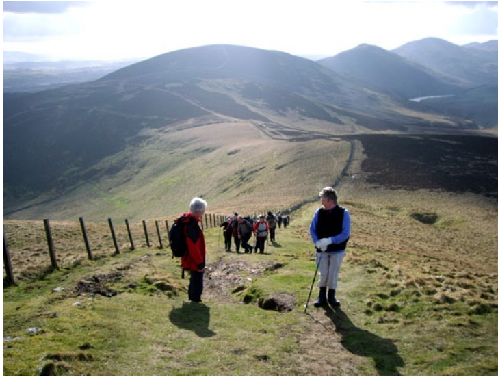
PNK Ramblers on the Pentlands

The Company Section (for boys in Primary 7 to 18 years of age) meets in the North Hall on Friday nights, from 7.30pm to 10.00pm. Activities include Christian Faith, badge work, physical training, bugling, pipe band, sports and games.